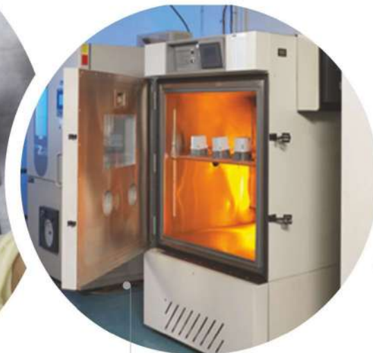
• Constant internal/external quality checks to maintain product consistency