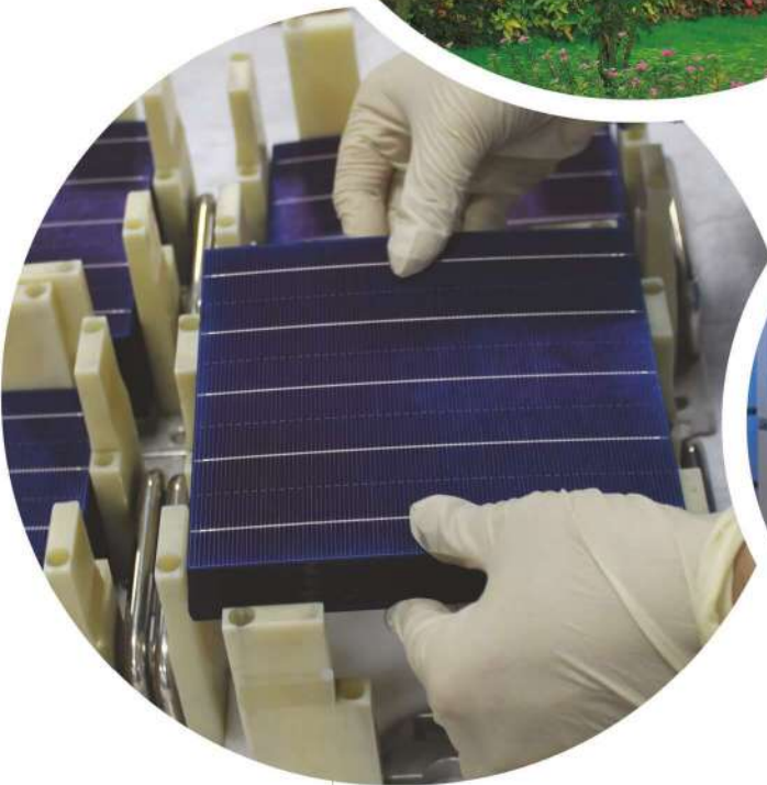
• Good encapsulation, quality ribbons and high efficiency cells ensure rated power output