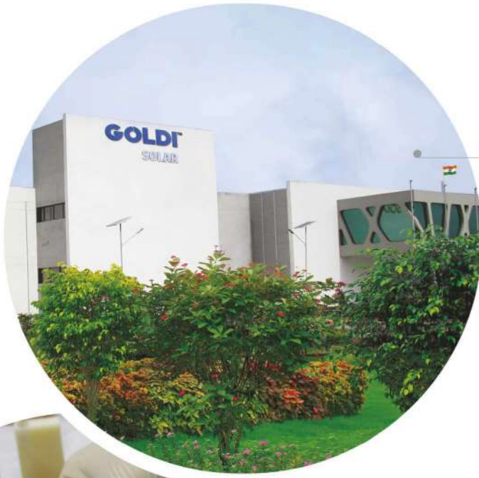
Manufacturing facility - Surat, Gujarat (INDIA)

Deployment of best manufacturing practices - QMS Systems