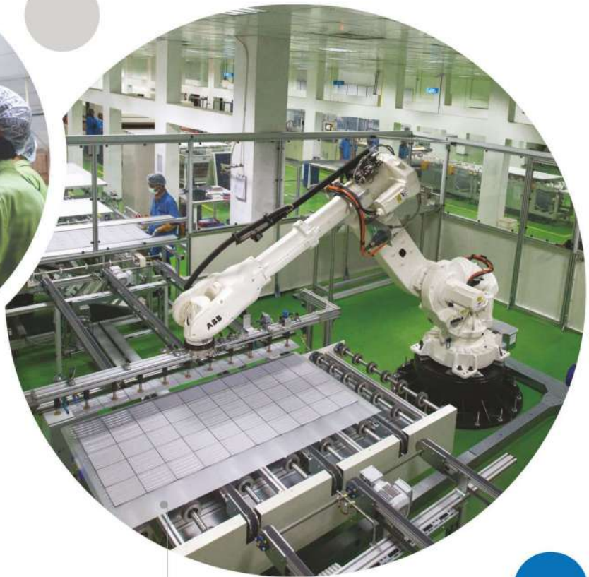
Automated robotic production facility