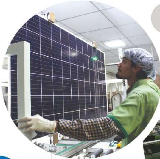
Detail-oriented meticulous Production Process